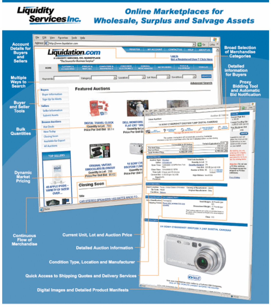
Integrated Services Support Business Buyers and Sellers in Over 500 Product Categories